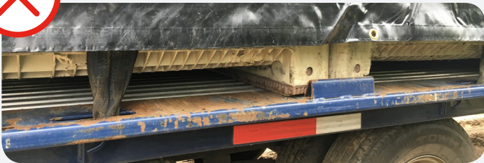
Tarping must be down to the truck bed.