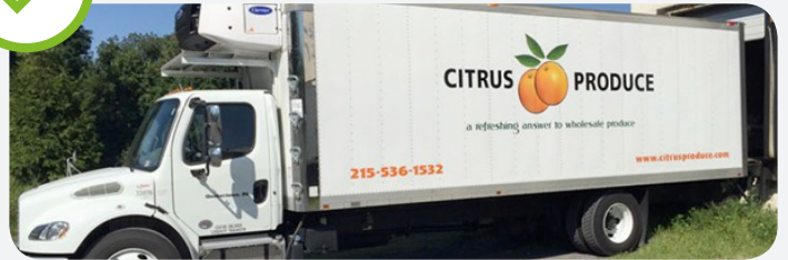
A fully enclosed truck.