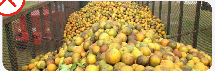
The vehicle must have proper tarping or be fully enclosed.

To learn more visit CDFA.ca.gov/plant/acp or contact the California Department of Food and Agriculture ACP program at 916-403-6846.