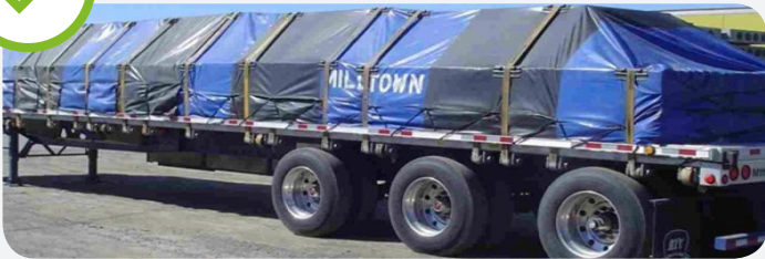
A properly tarped trailer.